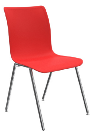
CO4A A : 17 3/4 " C : 18" E : 16 3/4 "