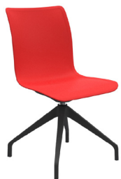
COBP A : 17 3/4 " C : 17 1/2 " E : 16 3/4 "