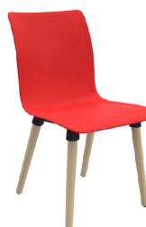
CO4B A : 17 3/4 " C : 18" E : 16 3/4 "