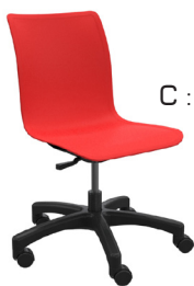
COBE A : 17 3/4 " C : 15 3/4 " - 21" E : 16 3/4 "